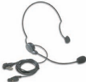
RHD-12X Behind-the-ear Earset with Boom Microphone, Pendant PTT and Clip