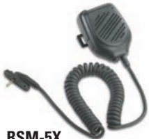
RSM-5X Speaker Microphone with Rotating Spring Action Clip