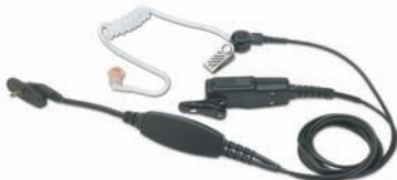
RHD-11X Security Earset with Pendant Microphone, PTT and Clip