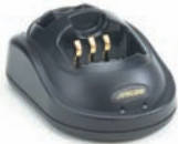
BC-JX Dual Slot Desktop 2.5 Hour Rapid Charger (100-240 VAC, 47-64 Hz) Holds two batteries. Charges sequentially (front to back)