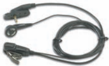
RHD-10X Single Earbud with Pendant Microphone, PTT and Clip