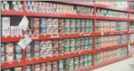
Paint Department -Instant assistance in areas that need a professional.