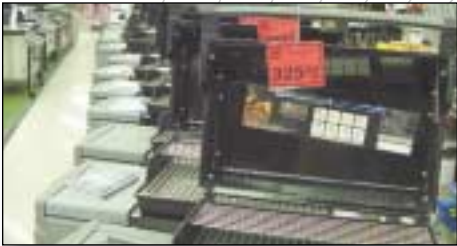
Grills -Allows customers to call the category "expert".