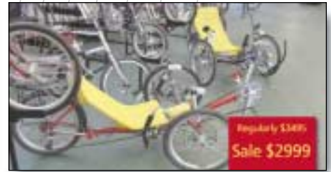
Point-of-Purchase Displays -Manufacturers can include the Quick Assist with P.O.P. promotions. Promote a sale item or special buy.