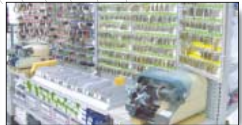
Key Cutting Area -Provide instant service to areas that need a specialist.