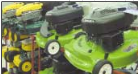
Lawn Mowers -Promote high ticket items, improve sales and productivity—allows customer to call the category "expert".