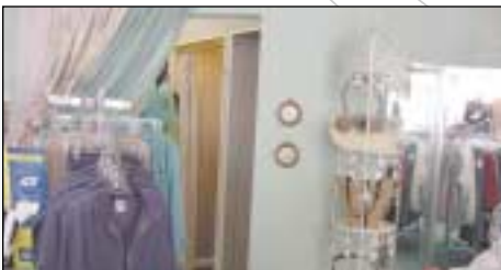
Fitting Rooms -Provide instant service and added convenience so that associate can retrieve a different size or color garment for the customer.