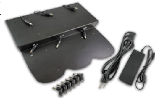
BC-6PR-KIT 6 Unit Charger Kit Includes: Base mounting plate, 6 plug pigtail cable, 6 adapters, and 110-220V AC Adapter. DOES NOT include 6 individual radio charging stands shown in image. Charging stands come standard with each HR Series radio. Dimensions: 11" W x 7" L x 4" H - Assembly Required