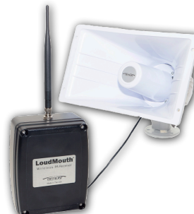
Loudmouth Wireless PA Stand-alone Mass Notification System. Make PA Announcements using your 2-way radio