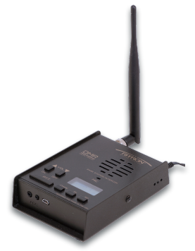
Desk Top Base Station AC powered 2-way radio. Always Ready, Always There, Always On