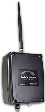
Radio-to-Intercom Bridge Make PA announcements through your wired PA System with your 2-way radios