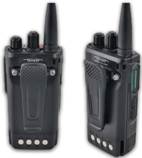
Slide On/Off Battery Pack & Spring-Action Belt Clip