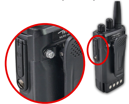
Multi-Pin Audio Accessory Jack