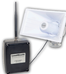
Loudmouth Wireless PA Stand-alone Mass Notification System. Make PA Announcements using your 2-way radio