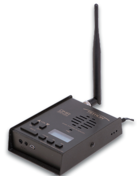
Desk Top Base Station AC powered 2-way radio. Always Ready, Always There, Always On