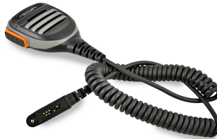
RSM-11HR Remote Speaker Mic