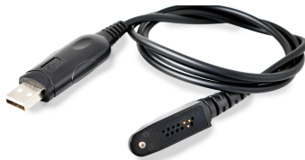
HR Series Programming Cable (60201144)