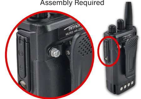
Multi-Pin Audio Accessory Jack